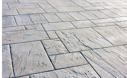
Figure 1: A tiled floor.

This is a “paper and pencil” activity where you use different colored pens or markers to fill in the squares of 32 \times 32 grid. The general algorithm we will be doing is called tiling and you see examples of this every day. Figure 1 shows a tiled floor.