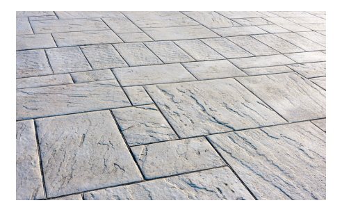
Figure 1: A tiled floor.

This is a "paper and pencil" activity where you use two different colored pens or markers to fill in the squares on a 32 \times 32 . The general algorithm we will be doing is called tiling and you see examples of this every day. Figure 1 shows a tiled floor.