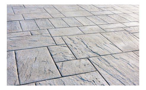
Figure 1: A tiled floor.

This is a "paper and pencil" activity where you use different colored pens or markers to fill in the squares of 32 \times 32 grid. The general algorithm we will be doing is called tiling and you see examples of this every day. Figure 1 shows a tiled floor.